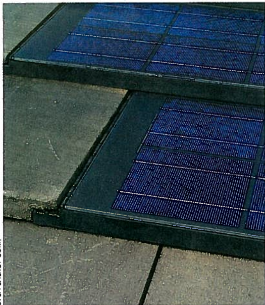
OPEN ENERGY CORP.